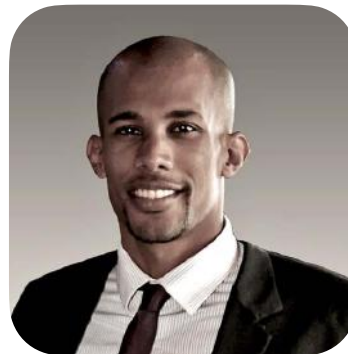
Fabien Anthony Global

Principal Secretary, State Department of Diaspora Affairs, Kenya Ministry of Foreign and Diaspora Affairs